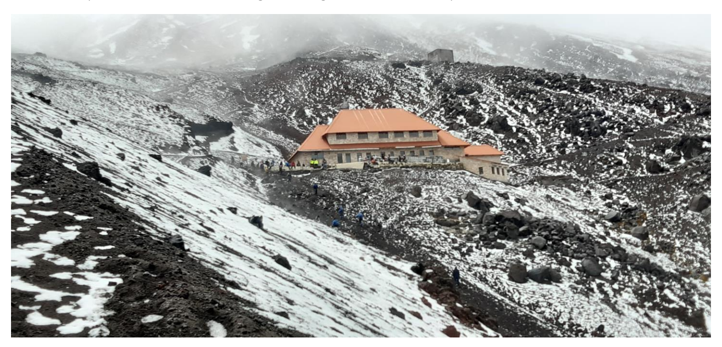
DAY 2: Cotopaxi National Park – Birding in the lagoon - Riobamba city

Take a short break and try a hot coca tea, this ancient drink will help you to mitigate the altitude sickness during the walk. From the viewpoint, you can see two extinct volcanoes and farms.