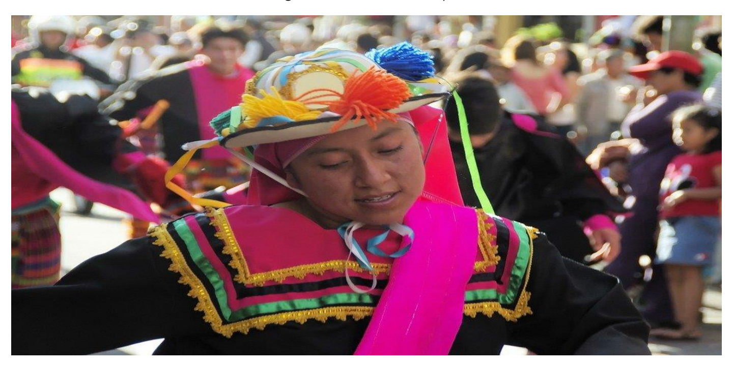
DAY 3: Chimborazo Natural Reserve – Indigenous town - Baños city

After breakfast, we head towards the Chimborazo fauna reserve. On the way, we will cross through colorful towns full of dynamism that gives the commerce of this area.